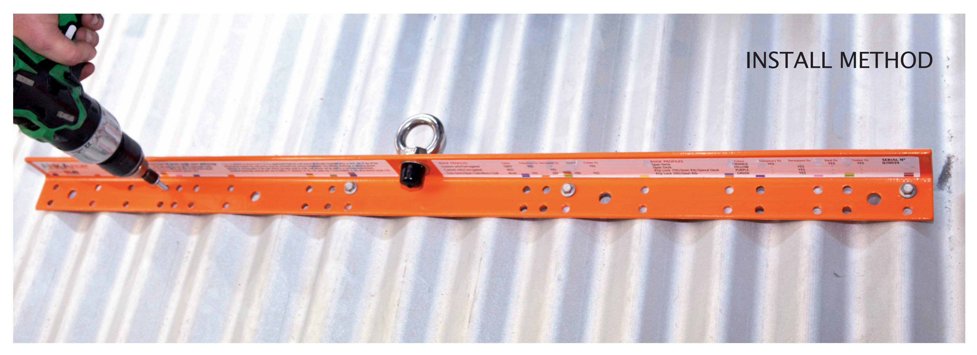
COMPLIES WITH AND ACCREDITED TO AS/NZS 1891.4: 2009 SINGLE POINT ANCHORAGE (15kN) AND AS/NZS 1891.2 SUPPLEMENT 1:2001 STATIC LINE USE

ACCREDITED PRODUCT | RE-USABLE | SURFACE MOUNTABLE | LIGHT WEIGHT EASY TO STORE | MULTI-FUNCTION | FITS MOST COMMON ROOF PROFILES AND CONCRETE FIX | ALIGNS TO SCREW PATTERNS | STATIC LINE USE